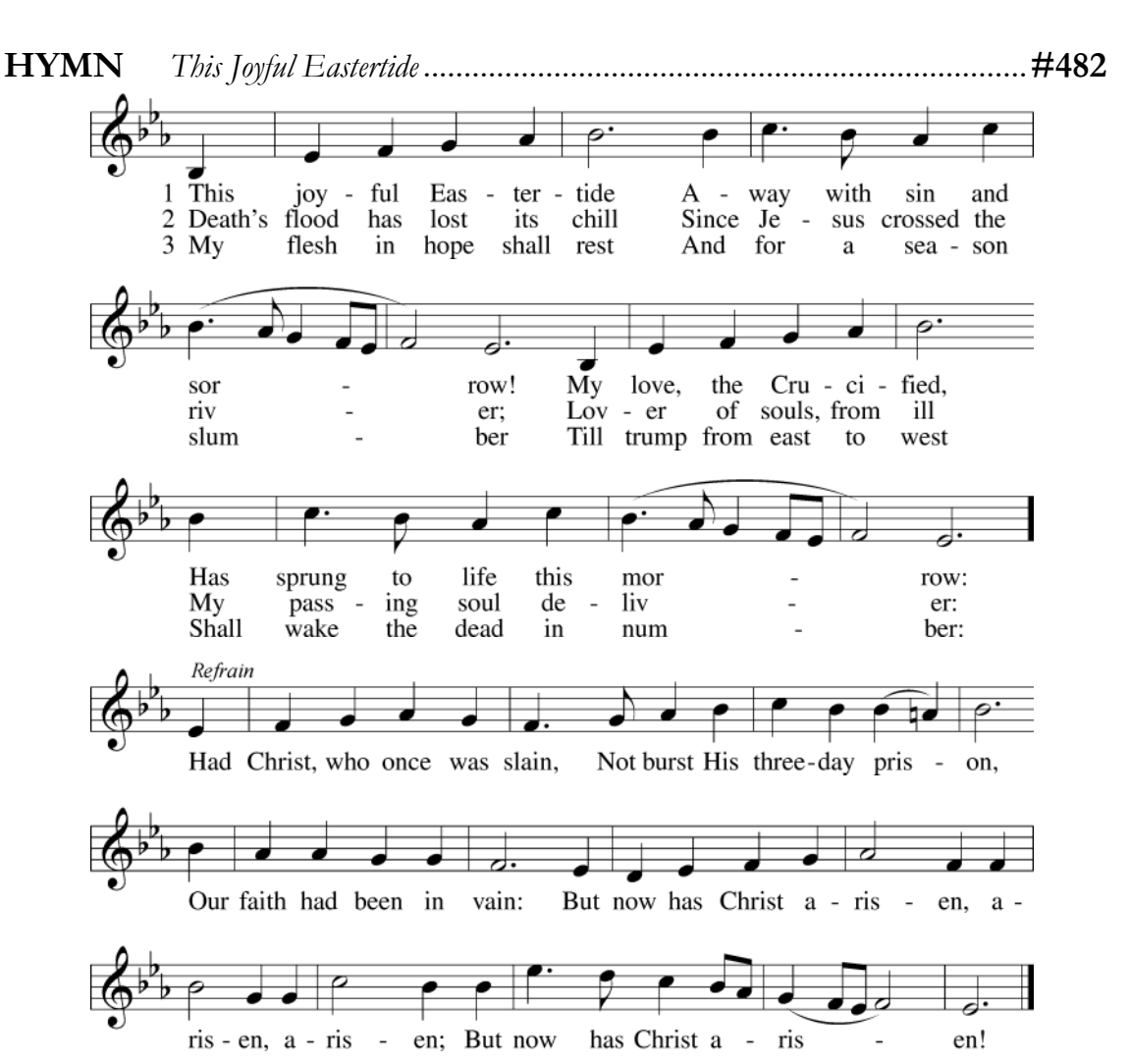
Text (sts. 1, ref, 2–3) and Music: Public domain Created by Lutheran Service Builder © 2006 Concordia Publishing House.