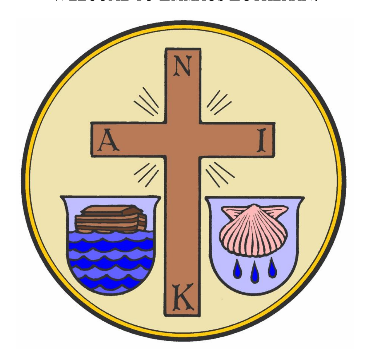
EASTER VIGIL ~ SUNRISE SERVICE MARCH 31, 2024